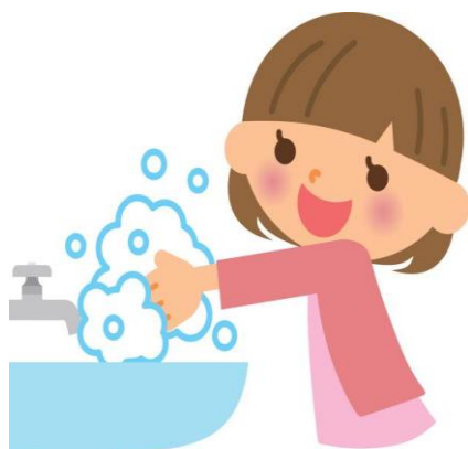
CLAIRE, 7 AM